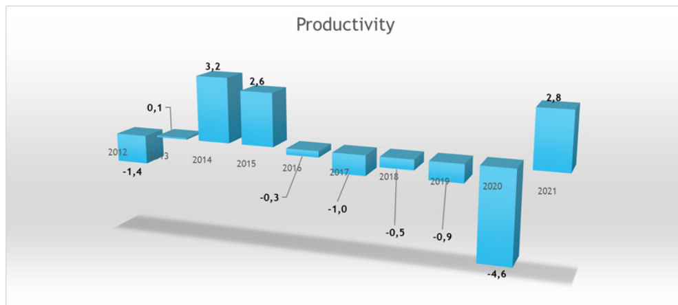
Figure 1 Labour productivity in North Macedonia, yearly (2012-2021)

Source: The source of the presented data for the employment is the Labour Force Survey (LFS) of the SSO. Additional information regarding the methodology of the survey can be found at the following link: http://www.stat.gov.mk/labour market